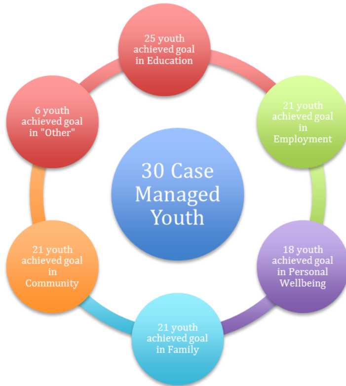
Graph 1: Achievement Plan Breakdown of Case Managed Youth